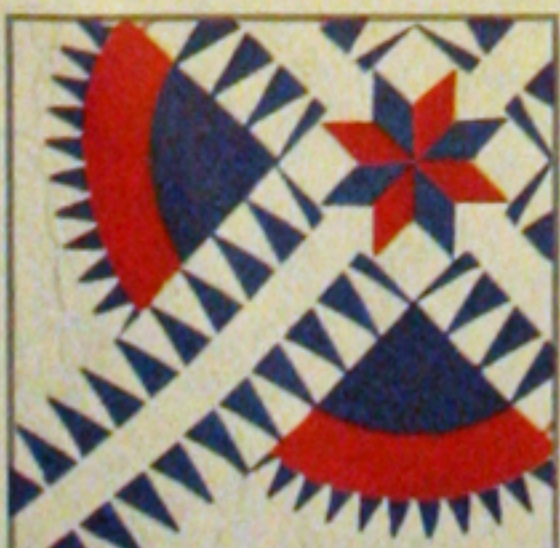
8-NEW YORK BEAUTY