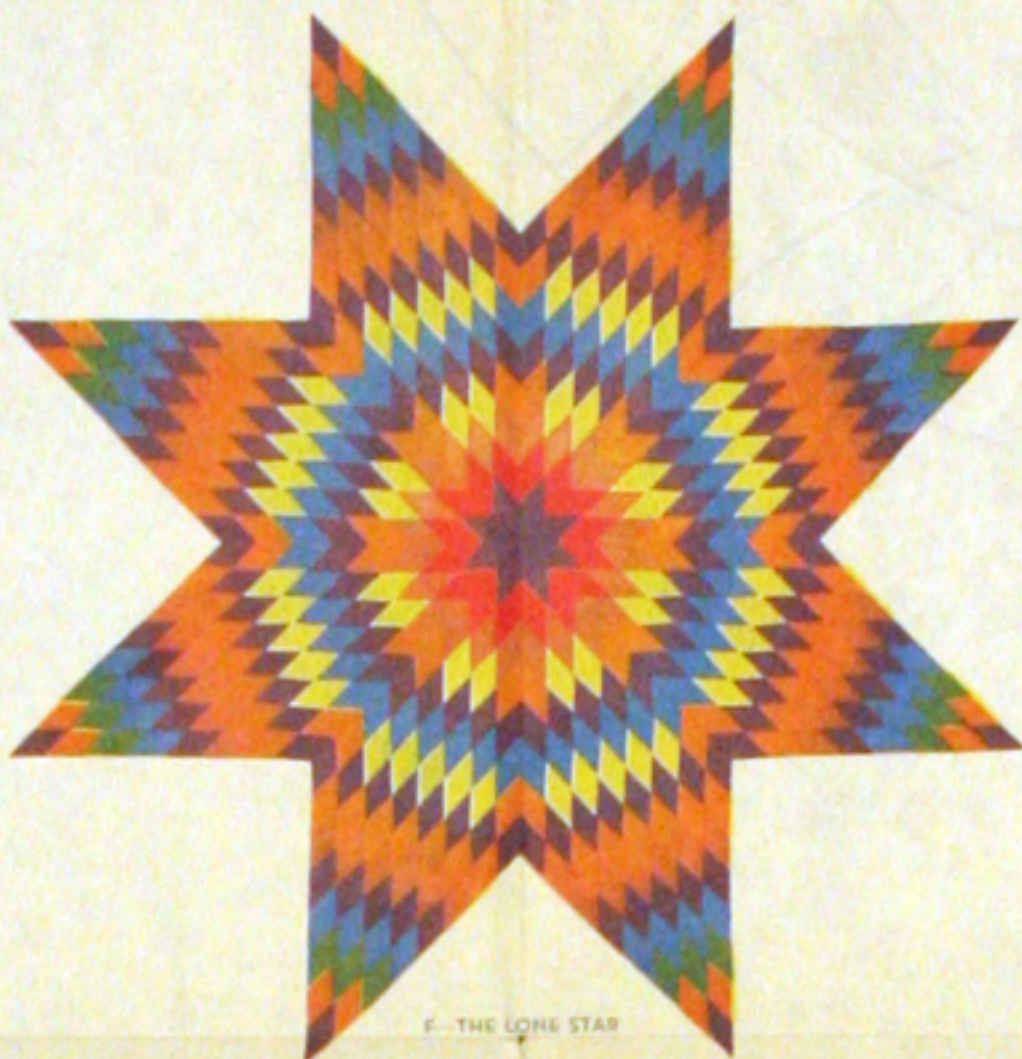
F-THE LONE STAR