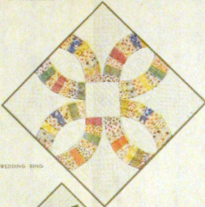
21-DOUBLE WEDDING RING