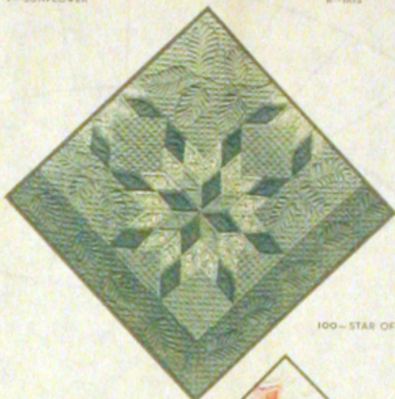
100-STAR OF BLUEGRASS