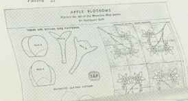
APPLE BLOSSOMS Pattern No. 40 of the Mountain Mist Series for Handmade Quilt

Each roll of MOUNTAIN MIST "Glazene" Quilt Barring includes one complete quilt pattern—a regular 25c pattern.