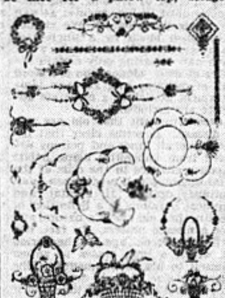
table cover, luncheon cloth, towel (with the initial in the center of the wreath), or onmoire lingerie cases. And here is a suggestion, if you

And as for its use, well it would be nice for a pillow top, bridge