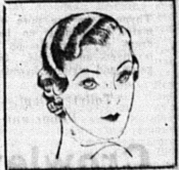
Our Former $10 Value