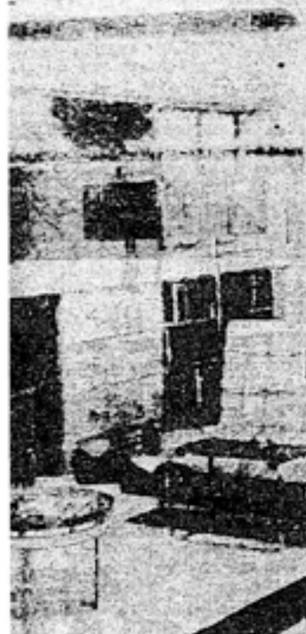
portion of the exterior and some of the fine detailing built and finished, and

Call who are interested in beautifying their homes in interior decoration, no more than three members will be admitted to this department. No other members. State your occupation clearly, and a self-addressed, stamped envelope, and a return letter with their answers and names, but names and addresses will