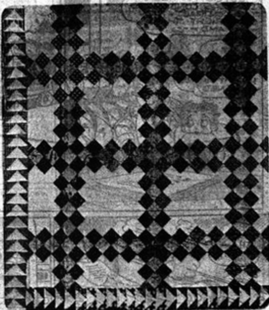
This Double Irish Chain has been made of lovely old-time calico, and in spite of the fact that it is 75 years old it is in excellent condition.