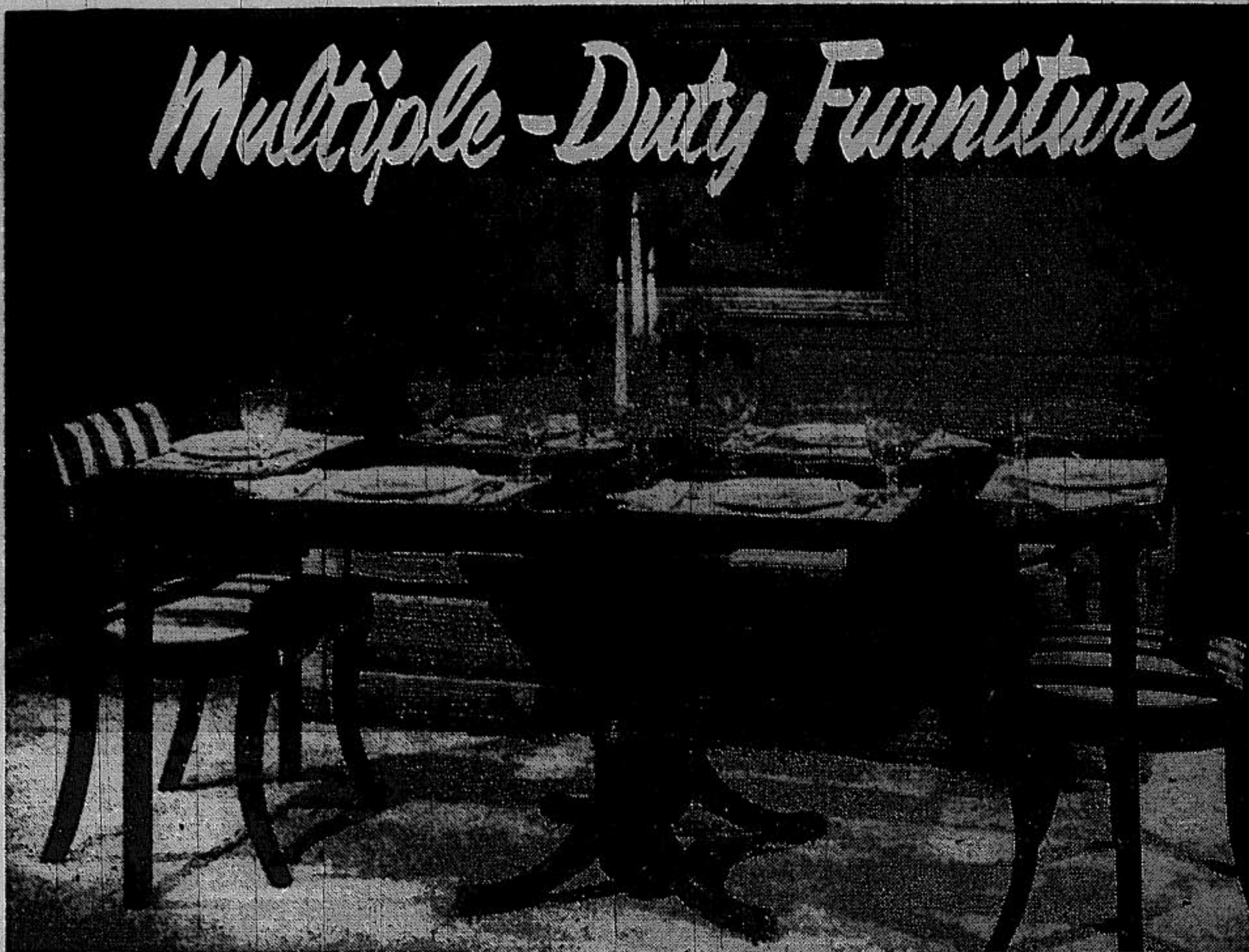
For this market the Hi-Lo table has been equipped with leaves and extra legs to make it an extension dining table that will accommodate eight.