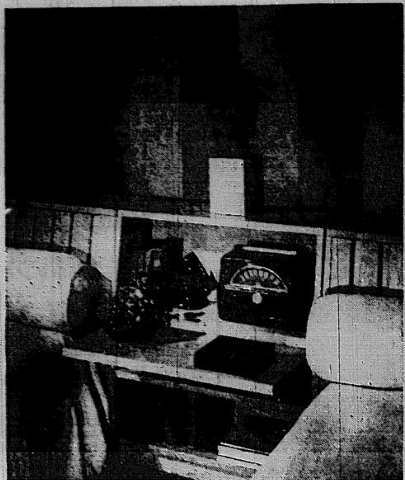
This shows one of two new night tables designed by Herbert Ten Have for the Cross Country group. When closed it matches the sliding panels of the bed head-board.