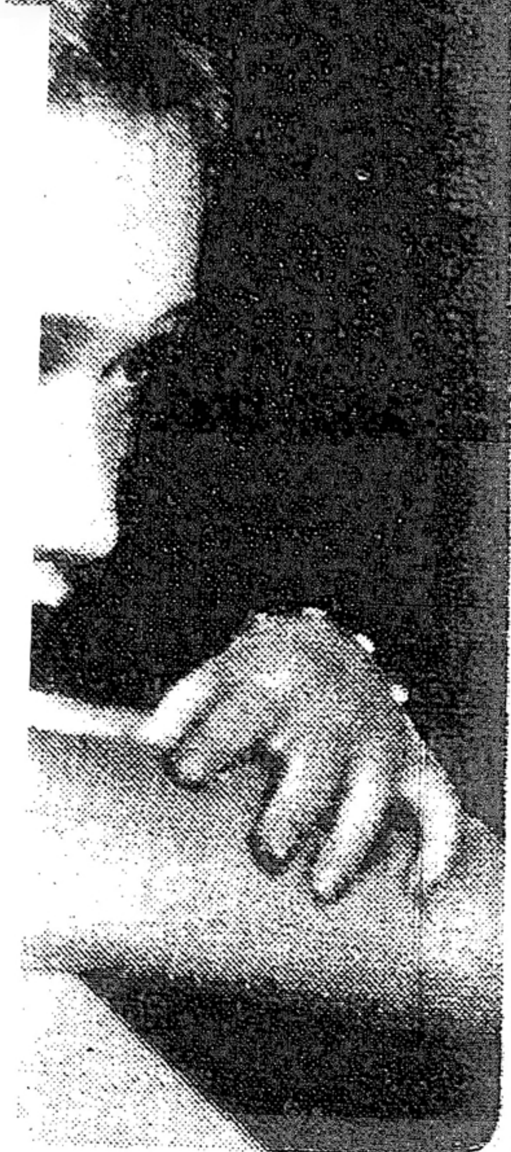
—Posed by Miriam Hopkins.

NON-satisfactory and not drying, but I am never without a cold cream used as a base, so that may be one reason why it worked so well. You may want to try it off with