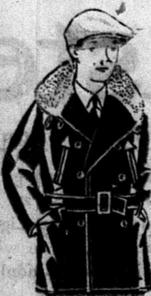
Sheeplined Coat of leatherette, $5.65

A new lov They offer promise of special em now and r fabrics. I