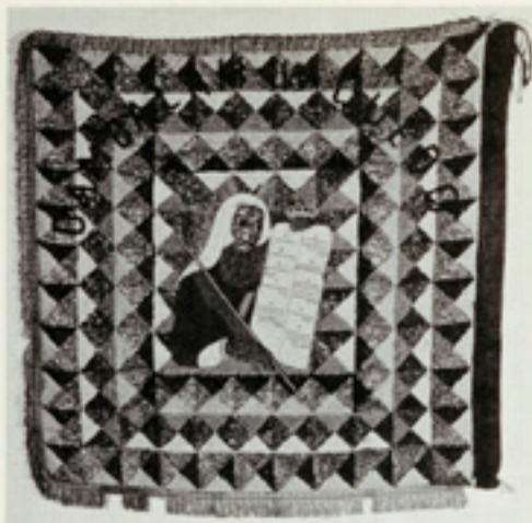
Art in Haitian Vodou